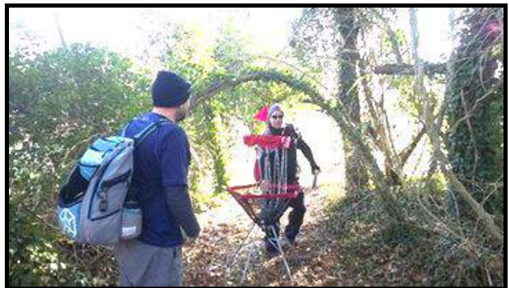
Chip and Mike surveying spring 2015

Overall placement in all six events determines finishing place. Loaner discs will be available for the disc golf round and discs will be supplied for the WFDF events but feel free to bring your own!