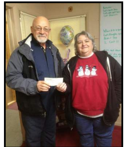
$700 + 180 lbs of can goods 2015 Presented to Halo

$1 extra for Ace pot - Ring of fire if no aces are hit.